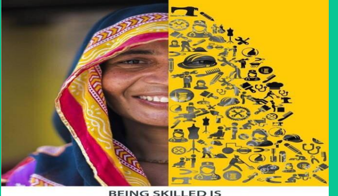
BEING SKILLED IS BEING EMPOWERED CELEBRATING WOMEN'S DAY