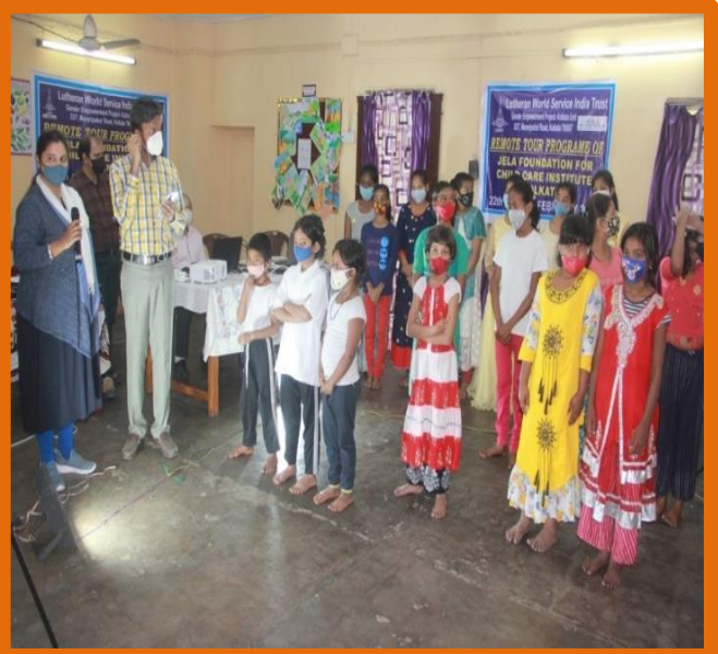
CCI Children performed through the Remote Tour Program for the JELA Foundation & Japanese students

Remote tour program of CCI presented by LWSIT to JELA Foundation & Japanese students